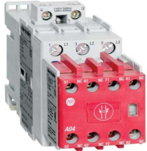
Representative Photo Only (actual product may vary based on configuration sections)

Description: 100S-C Safety Contactor, 23A, 110V 50Hz / 120V 60Hz