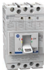
Cat. No. 140G-G6C3-D12

§ Does not provide overcurrent protection; may open above 1250 A.