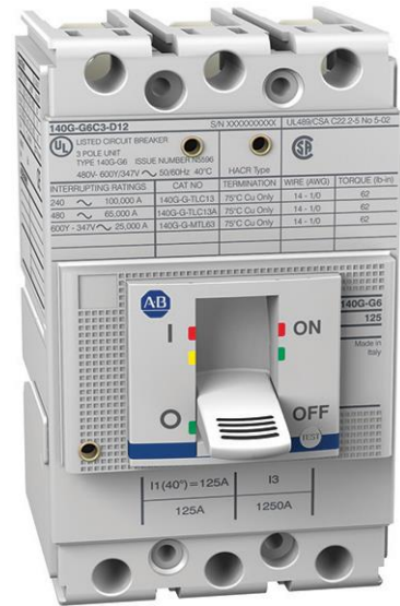
Representative Photo Only (actual product may vary based on configuration selections)

Description: 140G - Molded Case Circuit Breaker, G frame, 65 kA, T/M - Thermal Magnetic, Rated Current 40 A