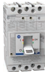
Cat. No. 140G-G6C3-D12

§ Does not provide overcurrent protection; may open above 1250 A.