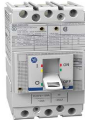
Representative Photo Only (actual product may vary based on configuration sections)

Description: 140G - Molded Case Circuit Breaker, G Frame, 65 kA, T/M - Thermal Magnetic, Rated Current 90 A, 1 NO/NC AUX, 250V