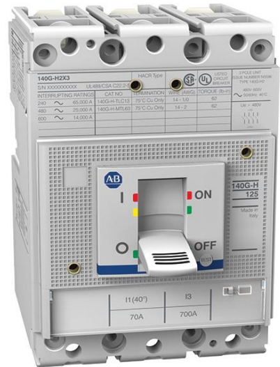
Representative Photo Only (actual product may vary based on configuration selections)

Description: 140G - Molded Case Circuit Breaker, H frame, 100 kA, T/M - Thermal Magnetic, Rated Current 70 A, 1 NO/NC AUX, 250V