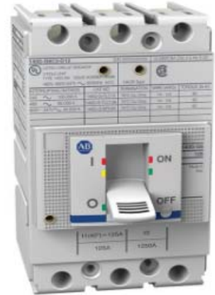
Representative Photo Only (actual product may vary based on configuration sections)

Description: 140G - Molded Case Circuit Breaker, J Frame, 100 kA, T/M - Thermal Magnetic, Rated Current 90 A