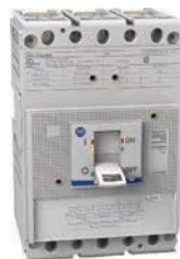
Molded Case Switch — UL489§

§ Does not provide overcurrent protection; may open above 2500 A.