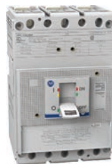
Molded Case Switch — UL489§

§ Does not provide overcurrent protection; may open above 2500 A.