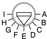
Typical Trip Unit Nameplate