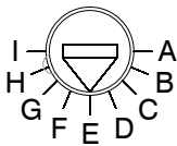
Typical Trip Unit Nameplate