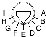
Typical Trip Unit Nameplate