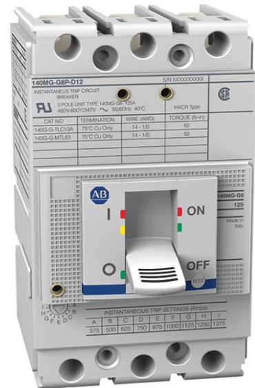
Representative Photo Only (actual product may vary based on configuration selections)

Description: 140MG - Motor Circuit Protectors, K frame, 35..65 kA at 480V, MCP (magnetic only), Rated Current 400 A