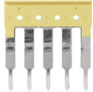
Representative Photo Only (actual product may vary based on configuration sections)

Description: Plug-in Center Jumper, 5 mm Center to Center, 50 Poles, Yellow