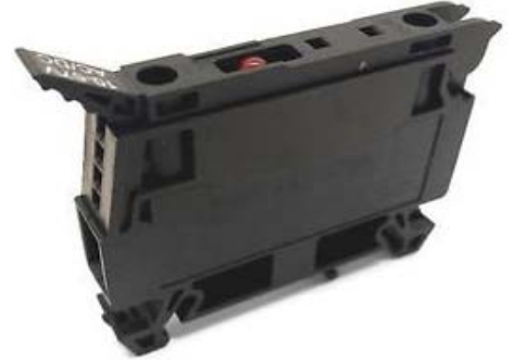
Representative Photo Only (actual product may vary based on configuration sections)

Description: 1492-W IEC Terminal Block, One-Circuit Fuse Block (5 x 20 mm Fuses, Type W), 4 mm (# 22 AWG - # 10 AWG) or 2.5 mm (# 22 AWG - # 12 AWG), Red LED indicator, Black (Standard)