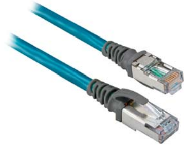
Photo Only (actual product may vary based on configuration selections) Representati