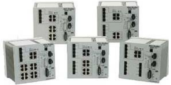
Representative Photo Only (actual product may vary based on configuration sections)

Description: Stratix 5700 Switch, Managed, 8 Fast Ethernet Copper Ports, 2 Gigabit Ethernet Combo Ports, Full Software, CIP Sync, DLR