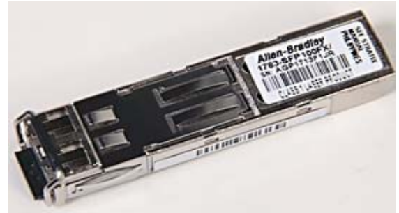
Representative Photo Only (actual product may vary based on configuration sections)

Description: Stratix Fiber SFP, 100 Mbit connectivity over single-mode fiber