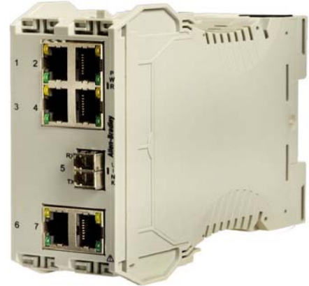
Representative Photo Only (actual product may vary based on configuration sections)

Description: Stratix 2000 Switch, Unmanaged, 6 Copper Ports, 1 Fiber with LC-Connector