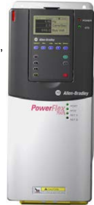
Representative Photo Only (actual product { æ Á vary based on configuration selections)

Description: PowerFlex70 AC Drive, G 400 V AC, 3 PH, F 15 A Amps, 1 HP Normal Duty, 1 HP Heavy Duty, IP20 / NEMA Type 1, with conformal coating, No HIM, No IGBT, No IGBT Installed, Without Drive Mounted Brake Resistor, 0 { { [ ] } } Environment Filter per CE EMC directive (89/336/EEC), No Communication Module, X & q ; A [ ] d [ | ] A a C X A U A No Feedback