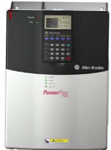
Representative Photo Only (actual product may vary based on configuration sections)

Description: PowerFlex700 AC Drive, 400 VAC, 3 PH, 72 Amps, 37 kW ND, 30 kW HD, IP20 / NEMA Type 1, with conformal coating, No HIM (Blank Plate), Brake IGBT Installed, without Drive Mounted Brake Resistor, Second Environment Filter per CE EMC directive (89/336/EEC), No Communication Module, Vector Control with 24V I/O, No Feedback