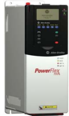
Representative Photo Only (actual product may vary based on configuration sections)

Description: PowerFlex700 AC Drive, 400 VAC, 3 PH, 2.1 Amps, 0.75 kW ND, 0.55 kW HD, IP20 / NEMA Type 1, with conformal coating, No HIM (Blank Plate), Brake IGBT Installed, without Drive Mounted Brake Resistor, Second Environment Filter per CE EMC directive (89/336/EEC), No Communication Module, Standard Control with No I/O, No Feedback