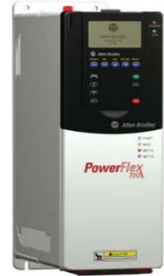
Representative Photo Only (actual product may vary based on configuration sections)

Description: PowerFlex700 AC Drive, 600 VAC, 3 PH, 9 Amps, 7.5 HP ND, 5 HP HD, IP20 / NEMA Type 1, with conformal coating, No HIM (Blank Plate), Brake IGBT Installed, without Drive Mounted Brake Resistor, Second Environment Filter per CE EMC directive (89/336/EEC), No Communication Module, Standard Control with No I/O, No Feedback