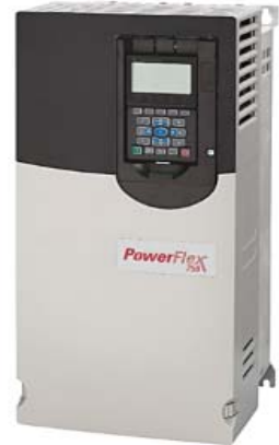
Representative Photo Only (actual product may vary based on configuration sections)

Description: PowerFlex 755 AC Drive, with Embedded Ethernet/IP, Air Cooled, AC Input with DC Terminals, Open Type, 8 Amps, (Fr1 5HP ND, 3HP HD/Fr2 5HP ND/HD), 480 VAC, 3 PH, Frame 2, Filtered, CM Jumper Removed, DB Transistor, Blank (No HIM)