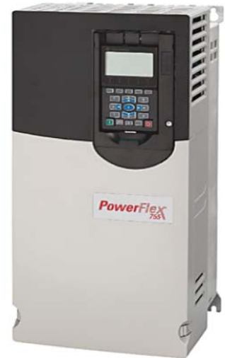
Representative Photo Only (actual product may vary based on configuration sections)

Description: PowerFlex 755 AC Drive, With Embedded Ethernet/IP, Air Cooled, AC Input with DC Terminals, Open Type, 2.7 Amps, 2HP ND, 1HP HD, 600 VAC, 3HP, Frame 3, Filtered, CM Jumper Removed, DB Transistor, Blank (No HIM)