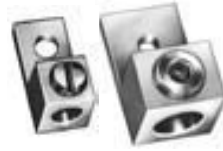
Fig. 1 Fig. 2