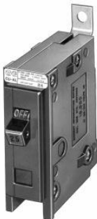
QUICKLAG Type BA 1-Pole