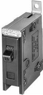
QUICKLAG Type BA 1-Pole