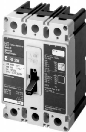
Typical Series C F-Frame Breaker