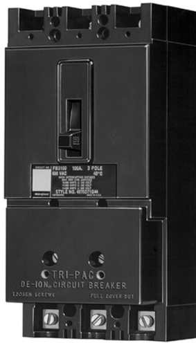
Type Tri-Pac FB Breaker

15 to 100 Amperes, 600 Volts Ac, 250 Volts Dc, Replaceable Current Limiters