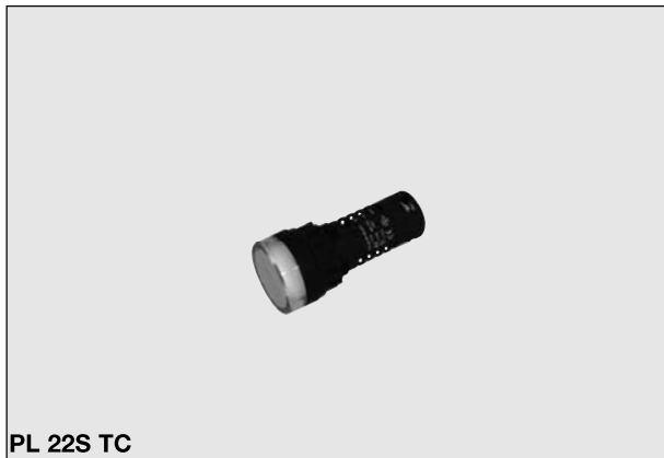
PL 22S TC