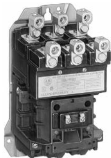
100 A, 3-Pole Open Type without Enclosure