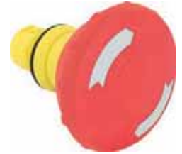
30 mm Non-Illuminated Twist-to-Release Cat. No. 800FP-MT34

* All emergency stop operators are EN ISO 13850 compliant with standard NC, NCLB, or self-monitoring contact blocks.