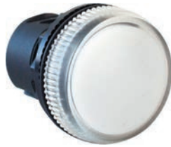
Plastic Pilot Light Cat. No. 800FP-P7