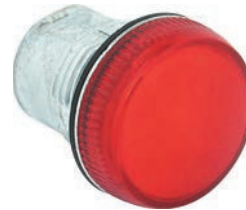
Metal Pilot Light Cat. No. 800FM-P4