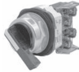
Knob Lever Operator Cat. No. 800T-H17A