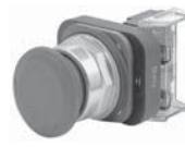
2-Position Push-Pull / Twist Cat. No. 800T-FXT6D4