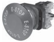
2-Position Metal Push-Pull Cat. No. 800T-FXLE6D4S