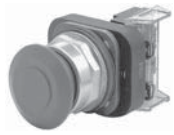
2-Position Push-Pull Cat. No. 800T-FX6D4

Note: A jumbo or large legend plate is recommended, if space allows.