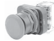
2-Position Push-Pull / Twist Cat. No. 800H-FRXT6D4