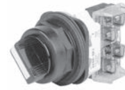
Standard Knob Operator Cat. No. 800H-HR2A