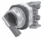
Knob Lever Operator Cat. No. 800T-H17A