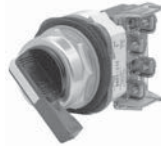
Knob Lever Operator Cat. No. 800T-H17A