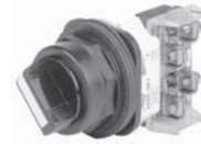
Standard Knob Operator Cat. No. 800H-HR2A