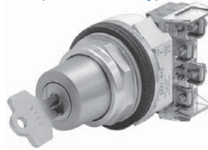
3-Position Cylinder Lock Operator Cat. No. 800T-J41A