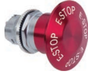
Cat. No. 800T-TFXLET6