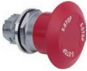
Cat. No. 800T-TFXJET6