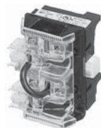
Self Monitoring Contact Block

Note: Modular suffix codes can be used when specifying selector switches with multiple contact blocks.