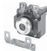
Time Delay Block