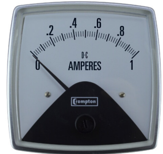
(Note: Product image may vary depending on model # and configuration.)