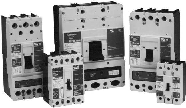
Series C Motor Circuit Protectors