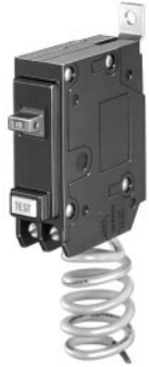
QUICKLAG Type QBGF 1-Pole Ground Fault Circuit Breaker