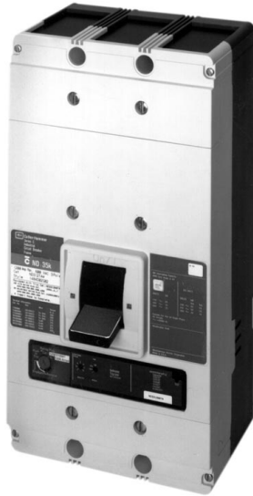
Typical Series C N-Frame Circuit Breaker