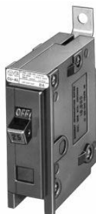
QUICKLAG Type BA 1-Pole