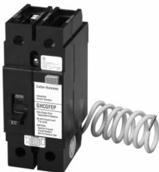
Single Phase Requires 2 Poles

These circuit breakers meet the requirements of UL489 and UL1053.