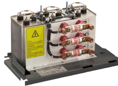
1.0 Space Factor Tray