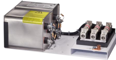
0.5 Space Factor Tray