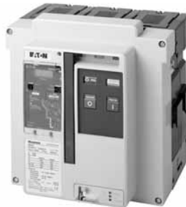
The Magnum MDSX Current Limiting Power Circuit Breakers have fast opening contacts to provide interrupting ratings up to 200 kA at 480 Vac without fuses.