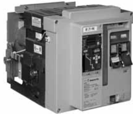
The Magnum MDSL Current Limiting Power Circuit Breakers have integral current limiters to provide interrupting ratings of 200 kA at 600 Vac.